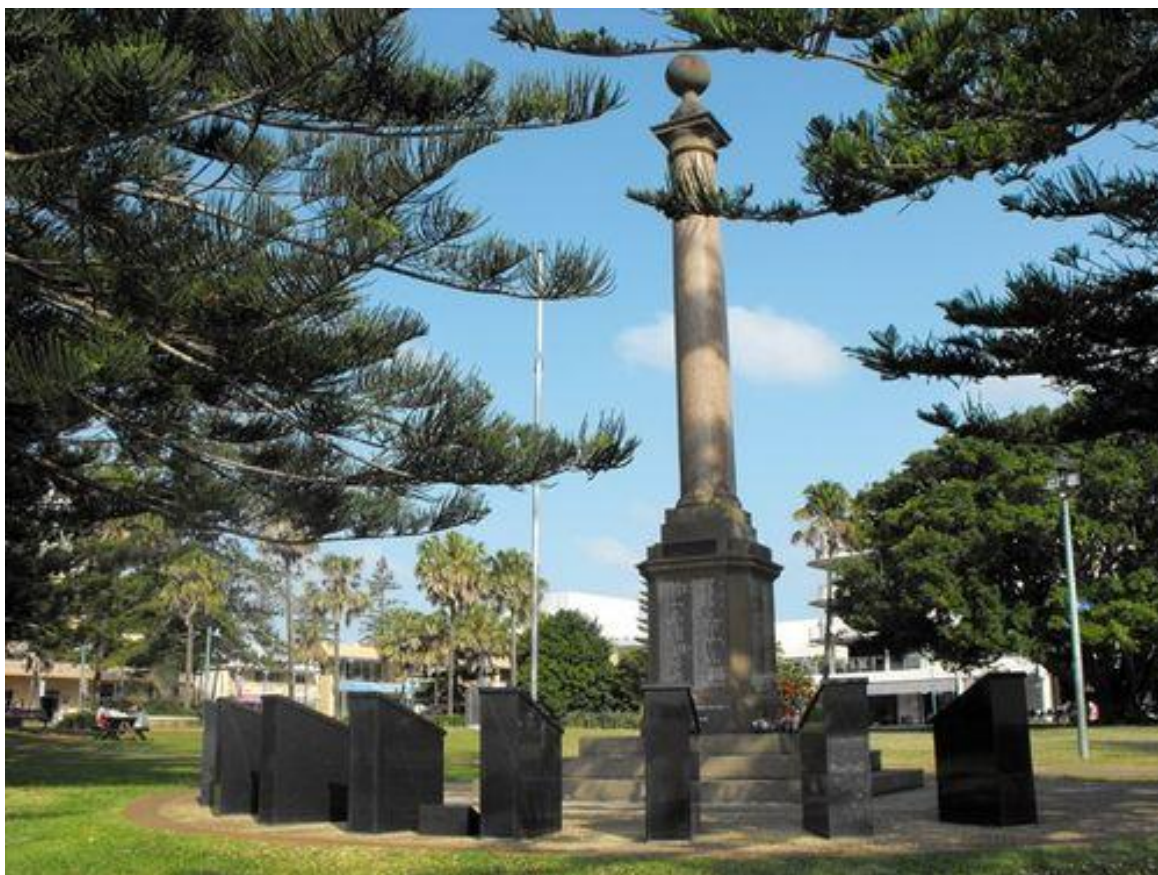
Port Macquarie Cenotaph

B. Campbell is remembered on the Port Macquarie Cenotaph, located in Town Square, Horton & Clarence Streets, Port Macquarie, NSW.