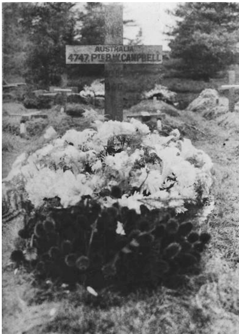
Original Cross Marker for Private Bruce Wilkins Campbell