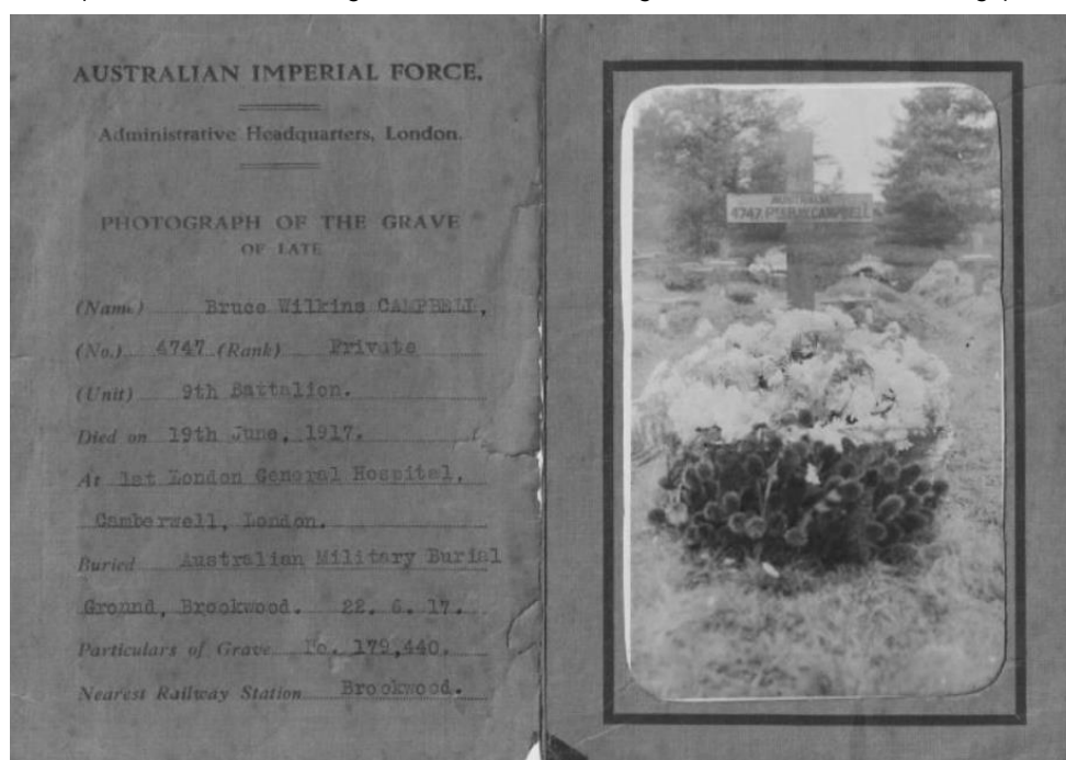
Memorial Folder given to the next-of-kin showing Photograph of Grave with Original Cross Marker