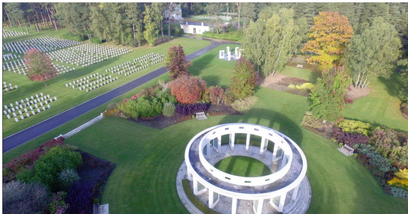
Brookwood Military Cemetery

There are 446 Australian War Graves in Brookwood Military Cemetery – 351 from World War 1 & 95 from World War 2.