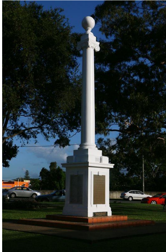
Murwillumbah War Memorial